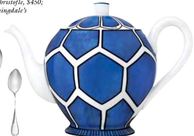
"Bleus d'Ailleurs" coffee/tea pot by Hermès, $595; Elements