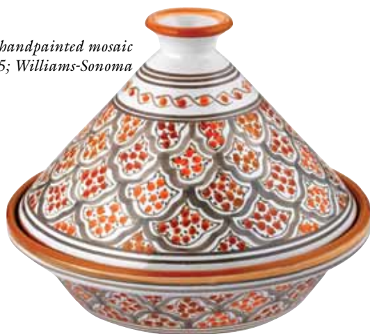
Tunisian handpainted mosaic tagine, $59.95; Williams-Sonoma