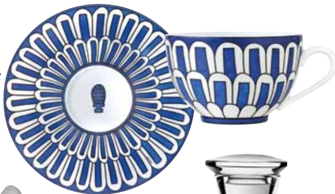
"Beluga" decanter by Baccarat, $495; Elements