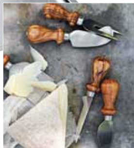
Antonini olive wood cheese knives (set of 5), $47.96; Williams-Sonoma