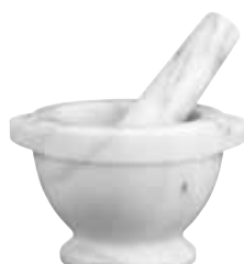
French Kitchen mortar and pestle, $29.95; Crate and Barrel

activity. So much so, that these outings seemed more like dates for the couple. Even at moments when the novelty began to wane, focusing on aspects of the home that interested them the most kept everything on track. "It truly felt like we were building a home based on both of our tastes and personalities," says the bride of the registry experience.