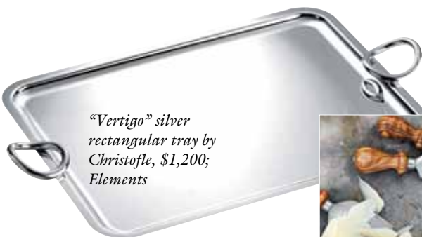
"Vertigo" silver rectangular tray by Christofle, $1,200; Elements

WILLIAMS-SONOMA williams-sonoma.com, 877.812.6235