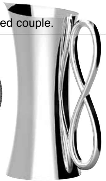
"Infinity" pitcher by Nambé, $150; Bloomingdale's