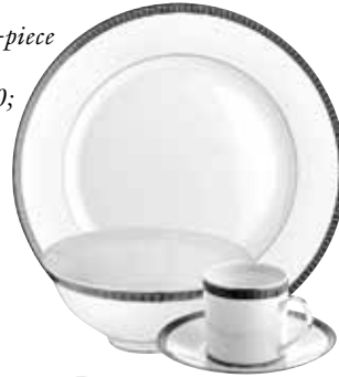
"Malmaison" 5-piece place setting by Christofle, $380; Bloomingdale's