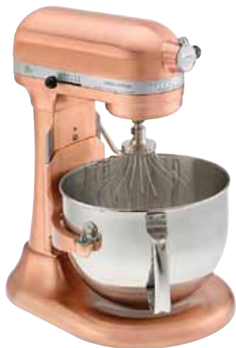
KitchenAid "Professional 620" stand mixer, $899.95; Williams-Sonoma