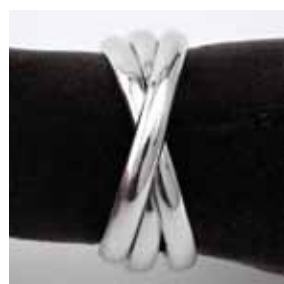
L'Objet rolling napkin rings (set of 4), $120; Elements