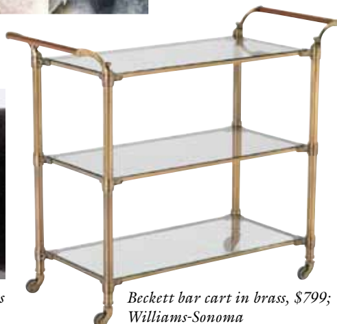
Beckett bar cart in brass, $799; Williams-Sonoma