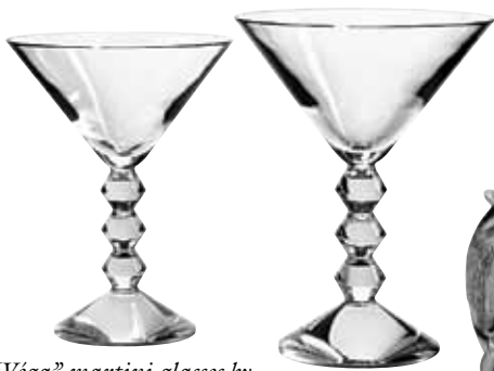
"Véga" martini glasses by Baccarat, $155/each; Elements

Consider great registry advice from one recently married couple.