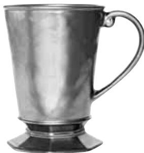
Juliska Pewter Collection stoneware mug, $29; Bloomingdale's