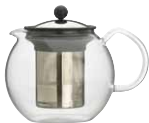
Bodum Assam tea press, $39.95; Crate and Barrel