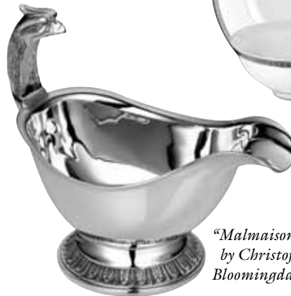
"Malmaison" gravy boat by Christofle, $450; Bloomingdale's