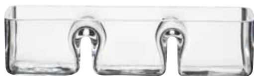
Three-part rectangle dish, $29.95; Crate and Barrel

Favorite registered items: Christofle "Malmaison" china, Bloomingdale's; "Bleus d'Ailleurs" tea set by Hermès, Elements; "Professional 620" stand mixer by KitchenAid, Williams-Sonoma; Littledeer omelet spatula, Williams-Sonoma