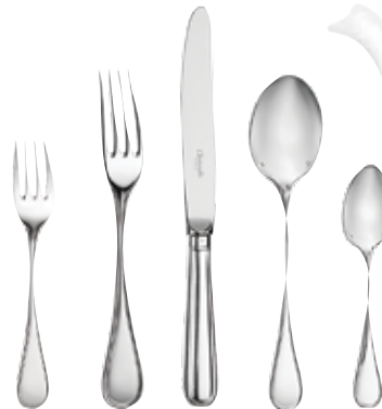
"Fidelio" 5-piece place setting in silver plate by Christofle, $394; Bloomingdale's