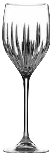
Vera Wang Wedgwood "Princess" wine glass, $45; Bloomingdale's