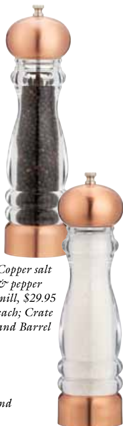
Copper salt & pepper mill, $29.95 each; Crate and Barrel