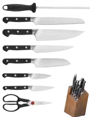
Zwilling J.A. Henckels Pro 8-piece knife block set, $399.95; Williams-Sonoma