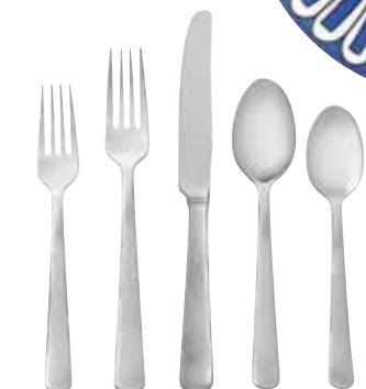
"Silver Echo" 5-piece place setting by Reed & Barton, $68.75; Bloomingdale's