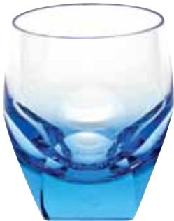
"Bar" double old-fashioned glass by Moser, $190; Elements